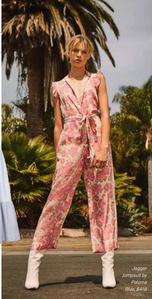
Jagger jumpsuit by Paloma Blue, $418